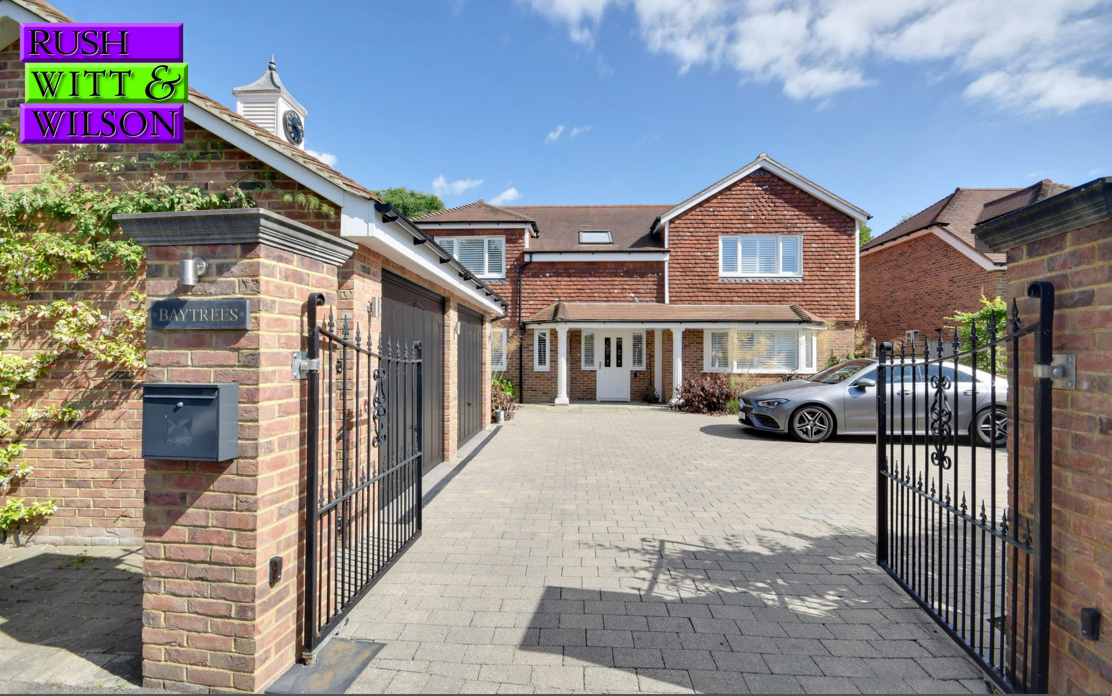
Baytrees, Ilex Close, Northiam, East Sussex, TN31 6DW. £925,000 Guide Price.